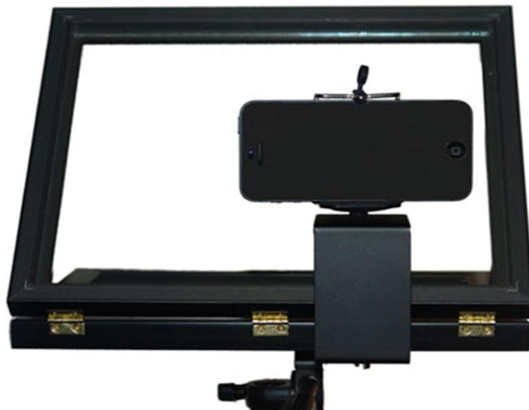
View from the back of the teleprompter